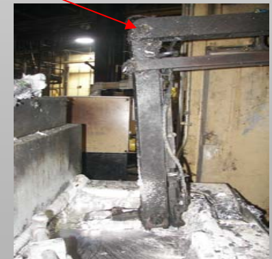
Alpha 2000 HD